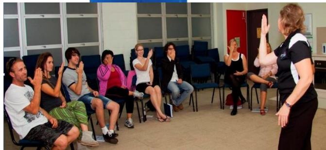
Sandwell - Communication Aids Centre, UK